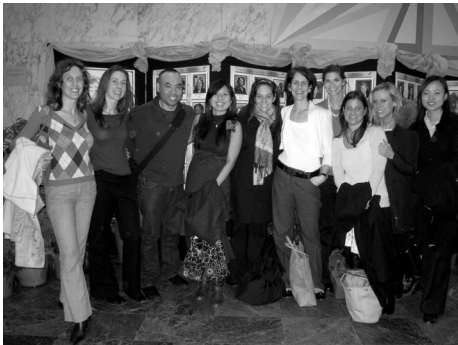
Hunter College graduate NPs pose before a Women's History display of New York's women legislators.